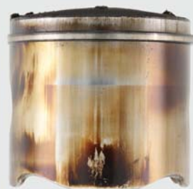
ECHO Power Blend @ 50:1