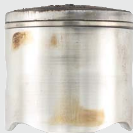
SABER Professional @ 100:1