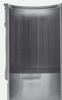
Severely Scuffed Liner