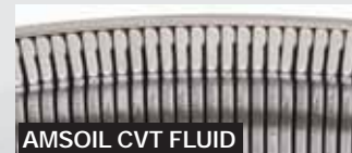
AMSOIL CVT FLUID