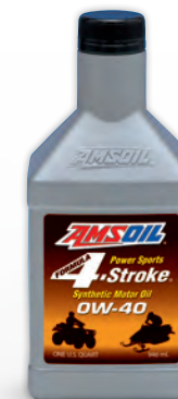
AMSOIL 0W-40 Formula 4-Stroke® Power Sports Synthetic Motor Oil