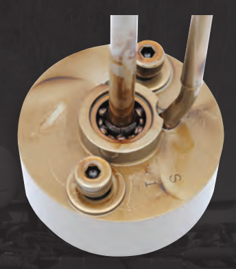
AMSOIL MULTI-VISCOSITY SYNTHETIC HYDRAULIC OIL (ISO 46)

In severe oxidation testing, AMSOIL Multi-Viscosity Synthetic Hydraulic Oil resisted elevated heat and oxidation more effectively than the conventional fluid. It helps hydraulic system components stay clean, operate reliably and last long.