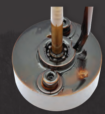
CONVENTIONAL HYDRAULIC OIL (ISO 46)